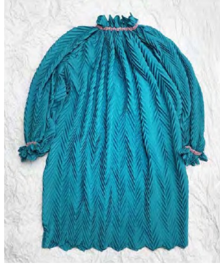
Hauptli, Ellen. Chevron Pleated Dress with Frostin .